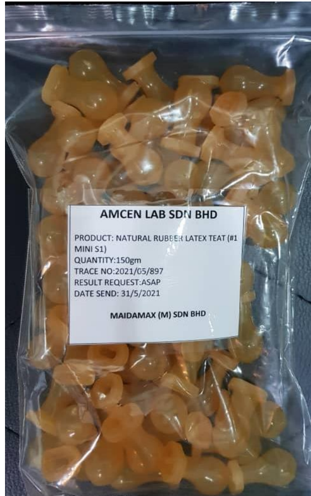
Picture of sample